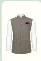
Stylish Dhoti Pants With Kurtas