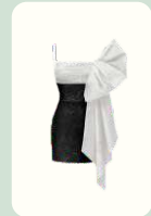
Easy Going Dress