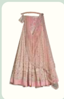
Royal Indian Lehenga