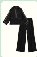
Stylish Pant- Shirt