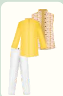
Indo-western Outfits With A Vest