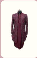
Kurta - Jacket