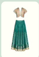
Crop Tops With Long Skirts